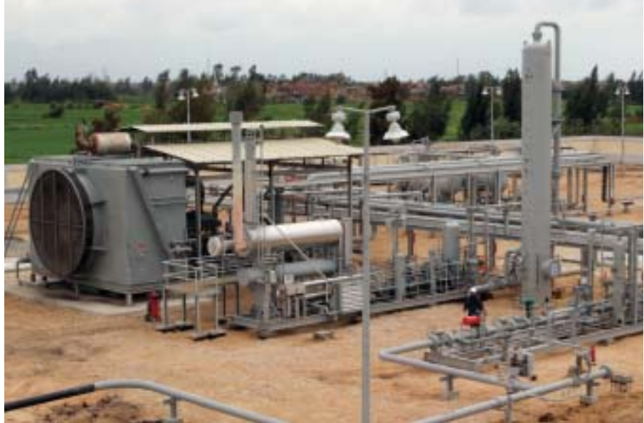
Canada's Centurion Energy holds rights to the first major concession in southern Egypt, Komombo.

Infrastructure to deliver gas from this field to market is being finalized and full production should start in July 2005 at approxi-