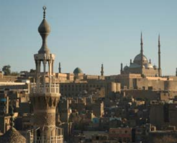
A section of the Cairo skyline evokes Egypt's ancient history.

Egypt's Mediterranean coast down to the Gulf of Aqabah, skirting the Israeli border. Completion of the pipe extension to Rehab in northern Jordan is due mid-2005, and then possibly to Syria and Lebanon and perhaps further afield to Turkey, although it seems likely that Turkey's demand will be satisfied from Iranian or Russian sources.