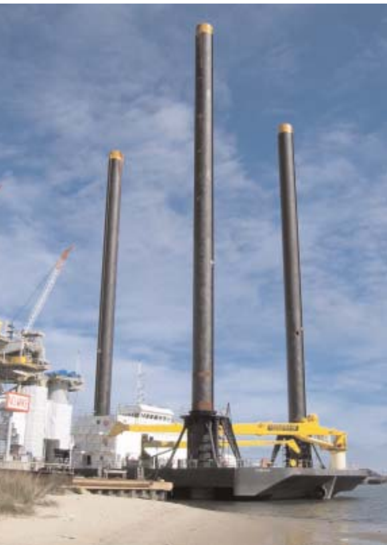
A jackup rig is ready for assignment offshore Egypt.

All new power stations are being built to accommodate dual oil-gas fueling, while the older ones have been converted. Power sta-