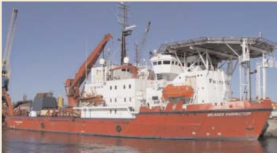
Sapescos is the largest Egyptian oilfield-services company.